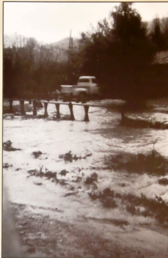
SHORELINE BETWEEN PINE & SPRUCE