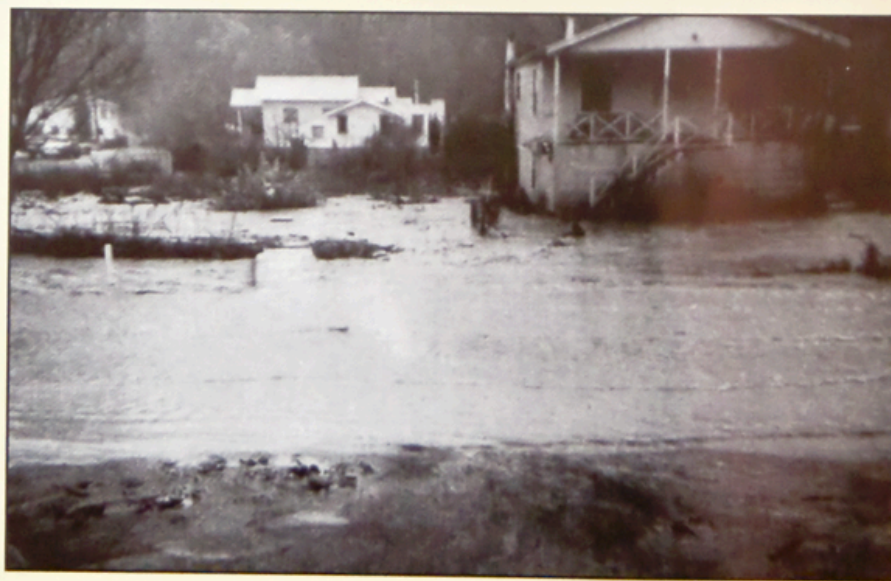
SHORELINE BETWEEN POPLAR & PINE ST.